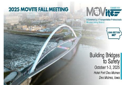
Figure 7 – 2025 MOVITE Fall Meeting