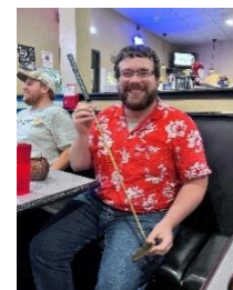
Figure 5 - NITE Appreciation Event at Adventure Golf Center