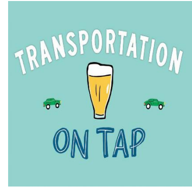
Figure 2 - Transportation on Tap