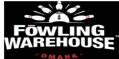
Figure 10 – Fowling Warehouse, Omaha