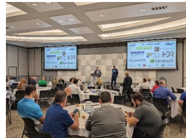
Figure 4 - NITE/ASCE Conference