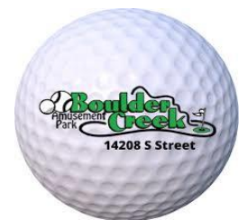
Figure 5 - NITE Appreciation Event at Boulder Creek