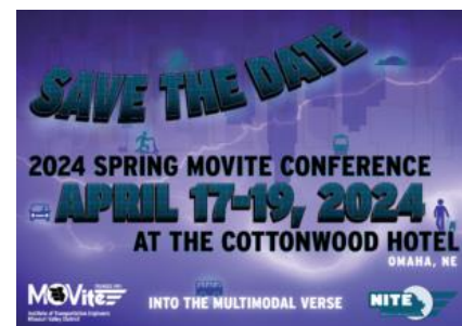
Figure 3 - MOVITE Save the Date