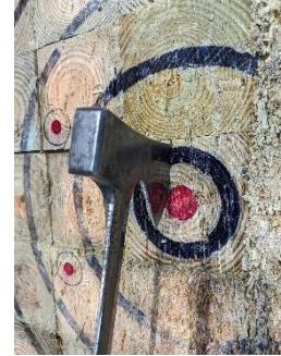
Figure 2 - YMC Event at Craft Axe Throwing in Lincoln