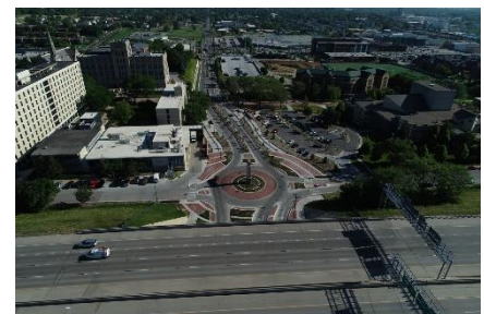
Figure 5 – Adam Denney presented on the 24 th Street Road Diet