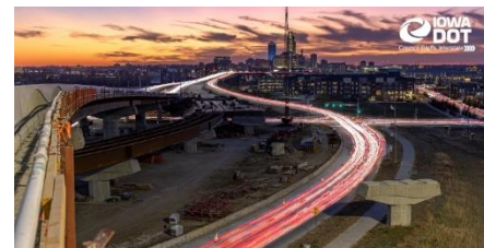
Figure 1 – Nick and Austin’s presentation on the closures of I-29 through Council Bluffs