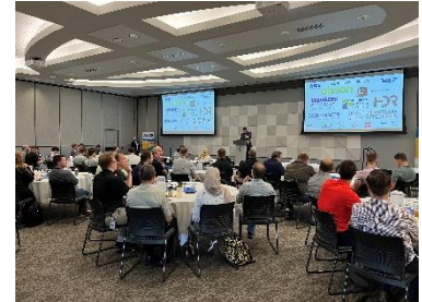
Figure 3 – NITE/ASCE conference