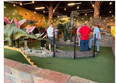
Figure 4 – NITE members enjoying mini golf