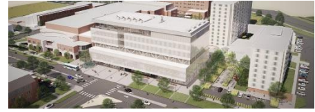
Figure 6 – Rendering of UNL's new Kiewit Engineering Hall