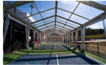
Figure 7 – YMC event at Blue Sky Patio & Pickleball