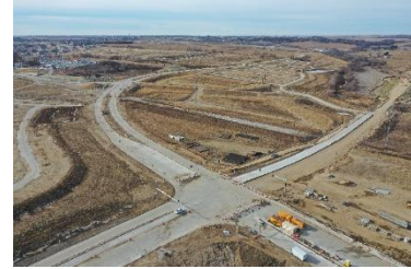
Figure 1 – Tony Egelhoff’s presentation on the Connect Sarpy – West Sarpy Program