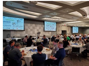
Figure 3 – NITE/ASCE logos