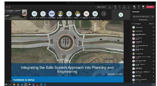
Figure 5 – Nicole Waldheim & Kendra Schenk from Burgess & Niple presenting on Safe System Approach Elements