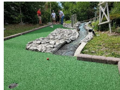
Figure 4 – NITE members enjoying mini golf