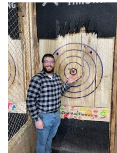
Figure 2 – Younger Members enjoying throwing axes