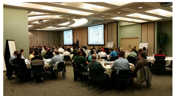
Figure 3 – The April ASCE/LOCATE Conference