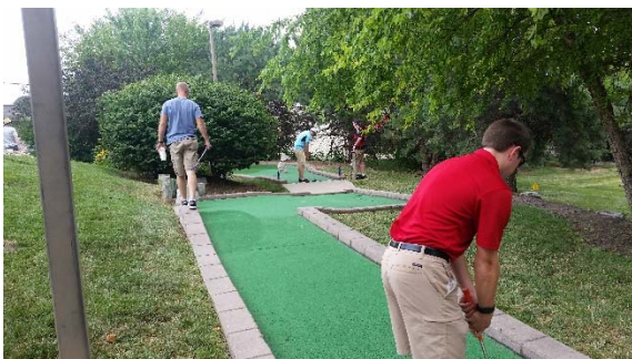
Figure 4 – LOCATE members enjoying the June member appreciation event