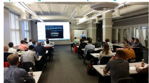
Figure 2 – NDOR ITS projects presentation