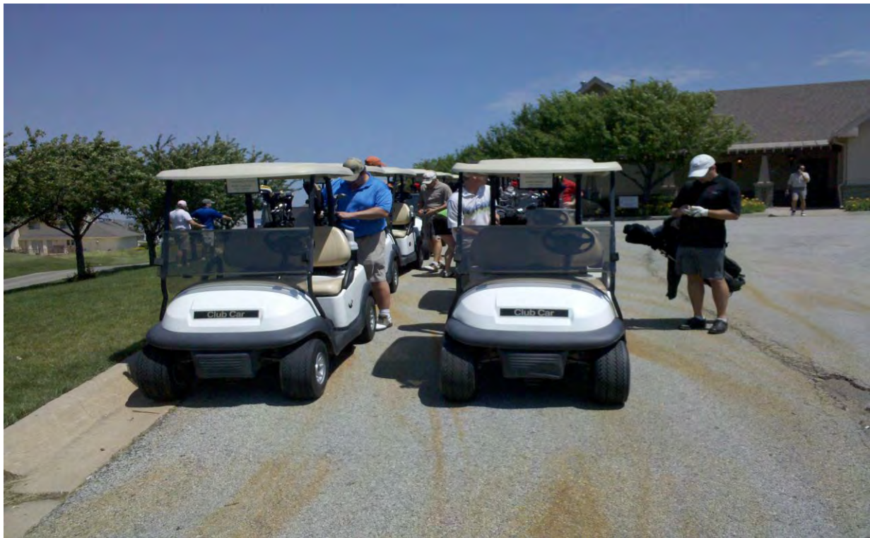
Start of the Annual LOCATE Golf Outing at Tregaron Golf Course in Bellevue, NE