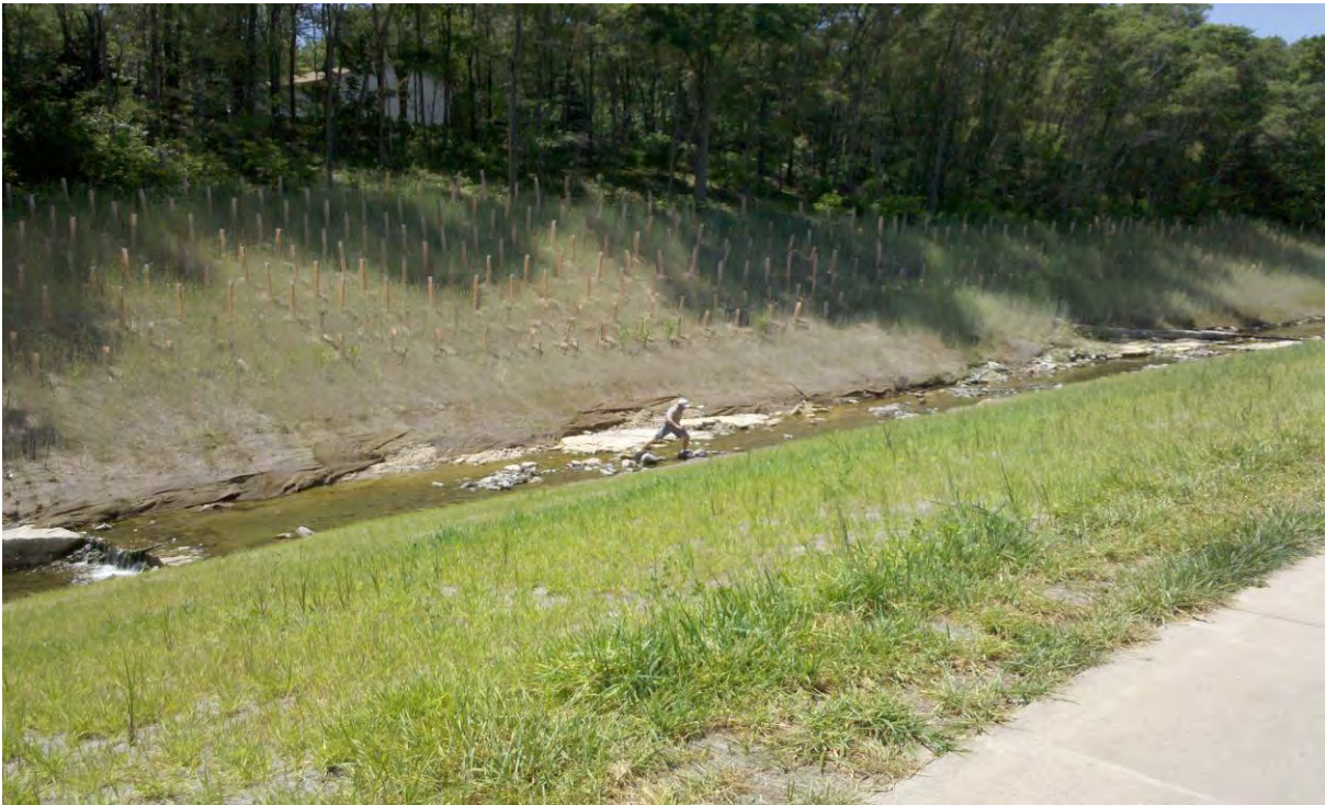
Inspecting an engineering project or retrieving a golf ball? LOCATE Annual Golf Outing