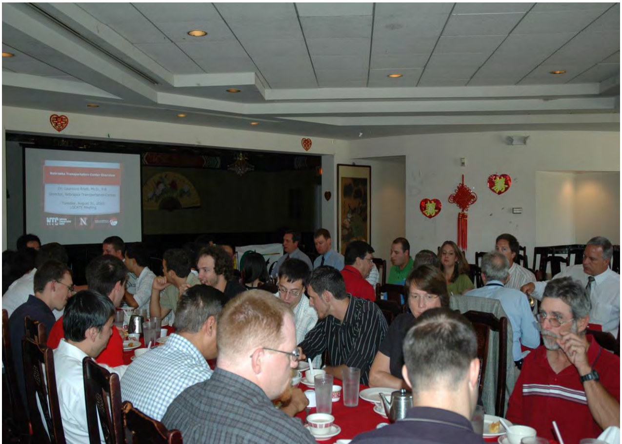
Photo of the August General Meeting in Lincoln, NE