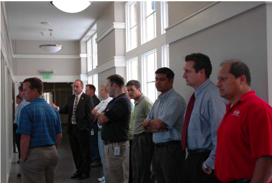
Photo of the tour of the renovated Whittier Building after the August General Meeting in Lincoln, NE